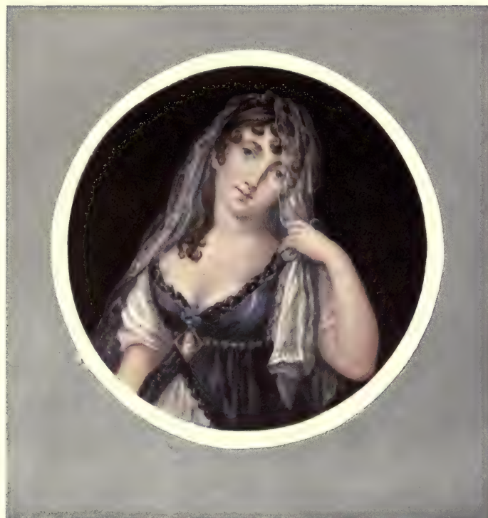
MADAME RÉCAMIER BY J. B. JACQUES AUGUSTIN